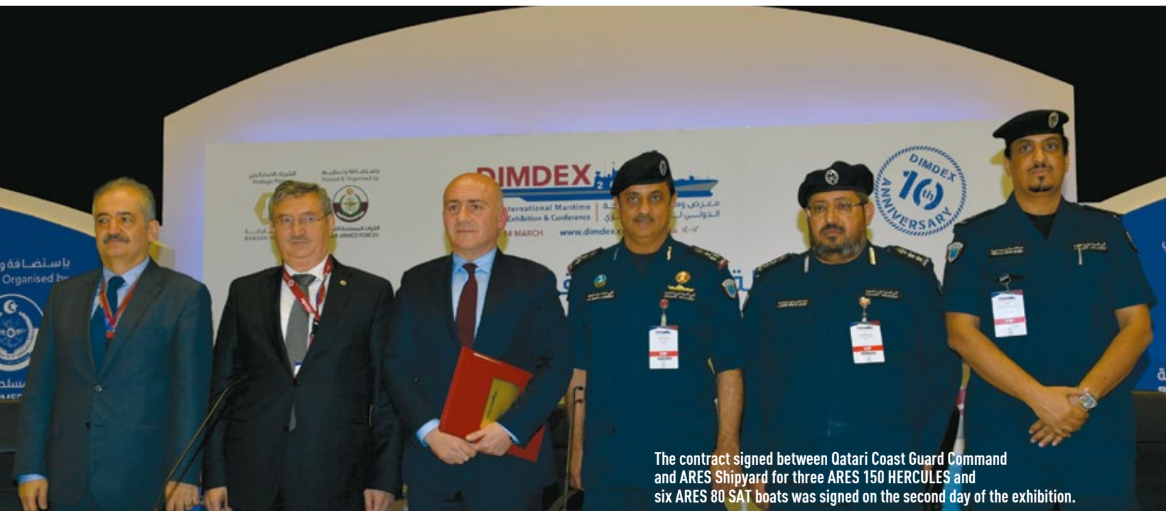
The contract signed between Qatari Coast Guard Command and ARES Shipyard for three ARES 150 HERCULES and six ARES 80 SAT boats was signed on the second day of the exhibition.