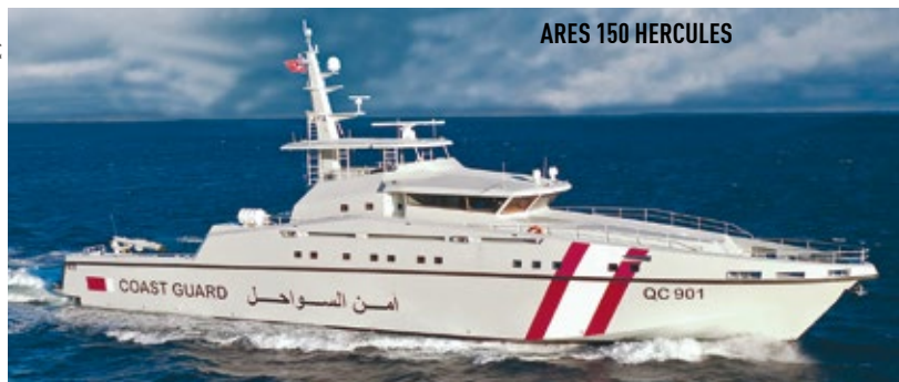
ARES 150 HERCULES