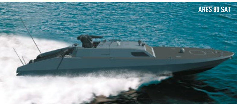
ARES 80 SAT